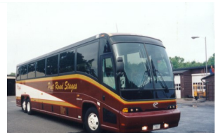
Post Road Tours

Post Road Tours 1105 Strong Road South Windsor, CT 06074 860/644-3484 www.postroadbustours.com