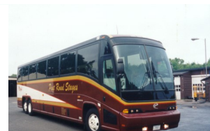
Post Road Tours

1105 Strong Road South Windsor, CT 06074 www.postroadstages.com