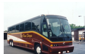
Post Road Tours

Post Road Tours 1105 Strong Road South Windsor, CT 06074 860/644-3484 www.postroadstages.com