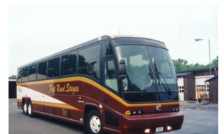
Post Road Tours

Post Road Tours 1105 Strong Road South Windsor, CT 06074 860/644-3484 www.postroadstages.com