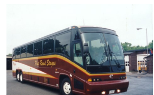
Post Road Tours

Post Road Tours 1105 Strong Road South Windsor, CT 06074 860/644-3484 www.postroadstages.com