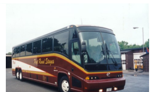
Post Road Tours

Post Road Tours 1105 Strong Road South Windsor, CT 06074 860/644-3484 www.postroadbustours.com